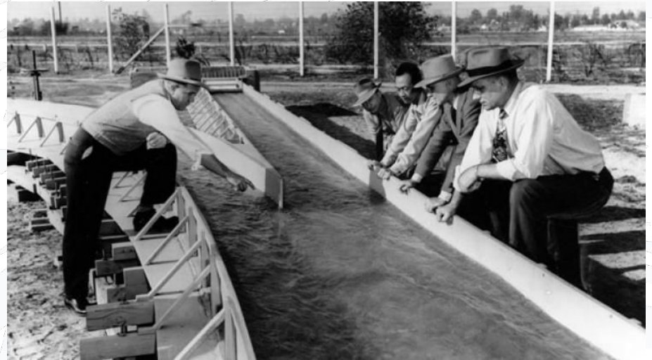
The U.S. Army Corps of Engineers' idea of a concrete flood control channel