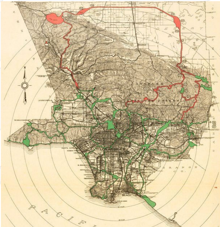
The Olmstead Brothers' "Emerald Necklace" park-filled plan