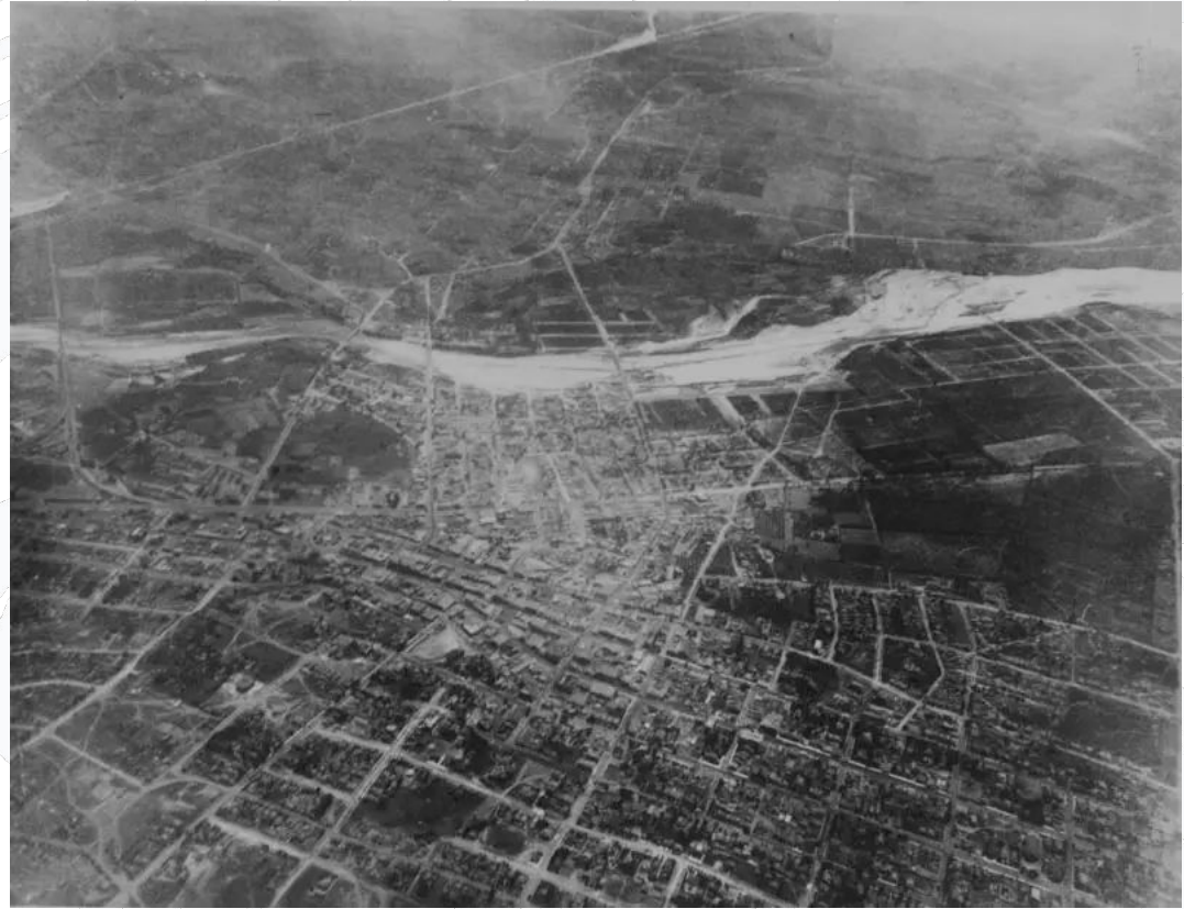
An 1887 aerial photo of Los Angeles, taken from a balloon.

As the city of Los Angeles grew, people built homes closer and closer to the River's banks.