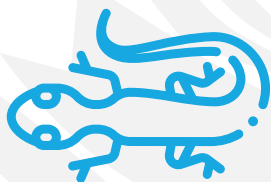
Western Fence Lizard