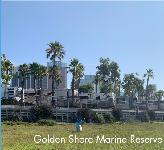
Golden Shore Marine Reserve