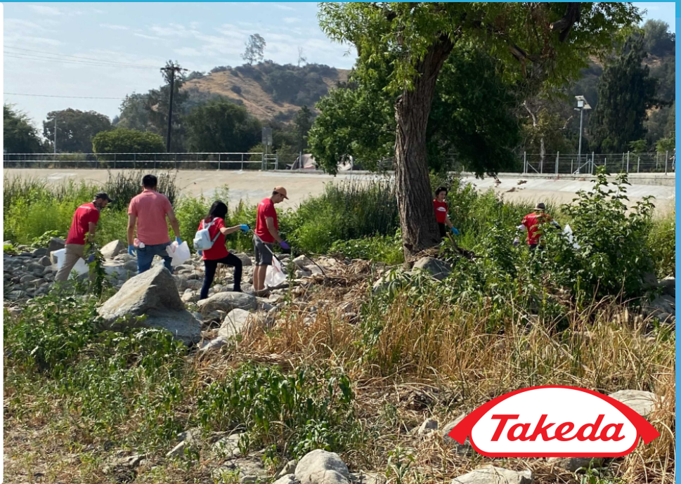
Volunteers from Takeda posing at Glendale Narrows (L), Team Takeda cleaning up important river habitat (R).