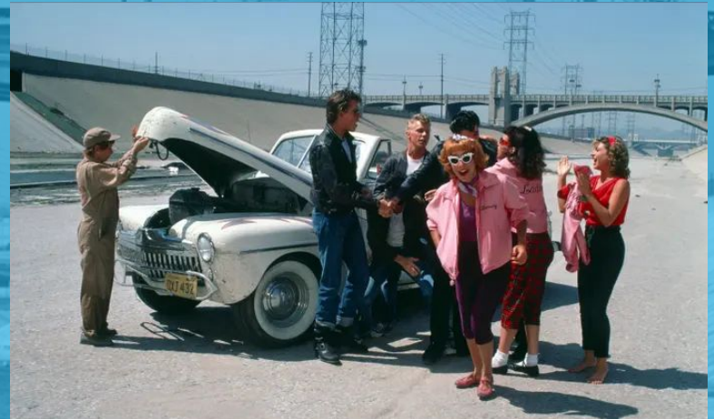
Image: the LA River in 1978 Grease