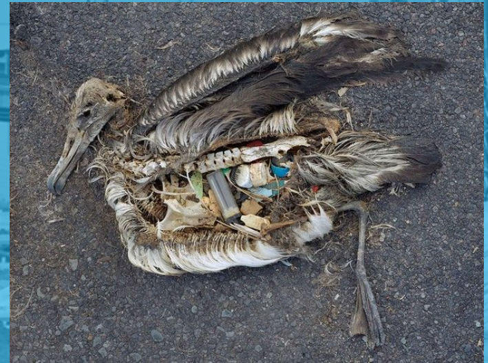
Image: the effects of plastic on wildlife