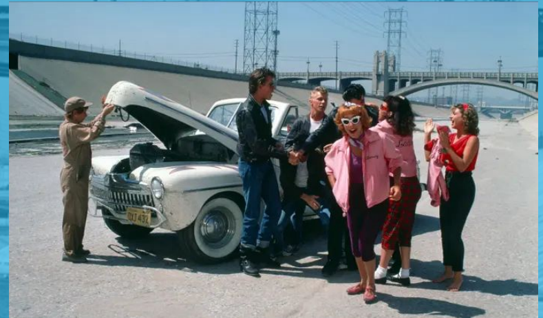
Image: the LA River in 1978 Grease