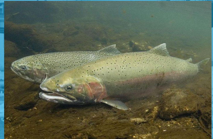
Image: the beautiful Steelhead Trout, a native fish which can no longer be found in the River