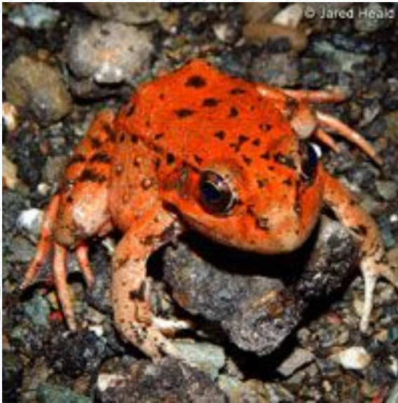
California red-legged frog: federally threatened

Many species that once called the River their home are now endangered (at risk of extinction) or threatened (at risk of becoming endangered), due to habitat loss.