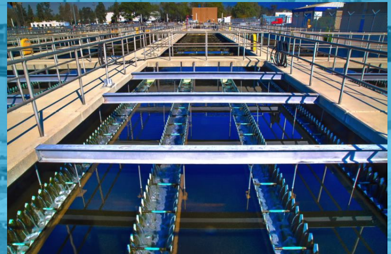
Image: the Los Angeles- Glendale Water Reclamation plant, one of three plants that release water into the River.