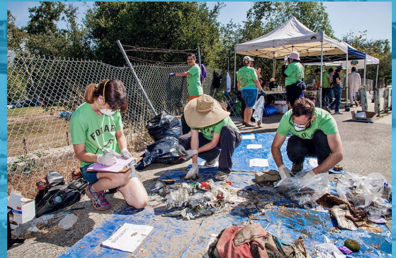
Image: FoLAR staff sorting and counting trash found at our Annual CleanUp