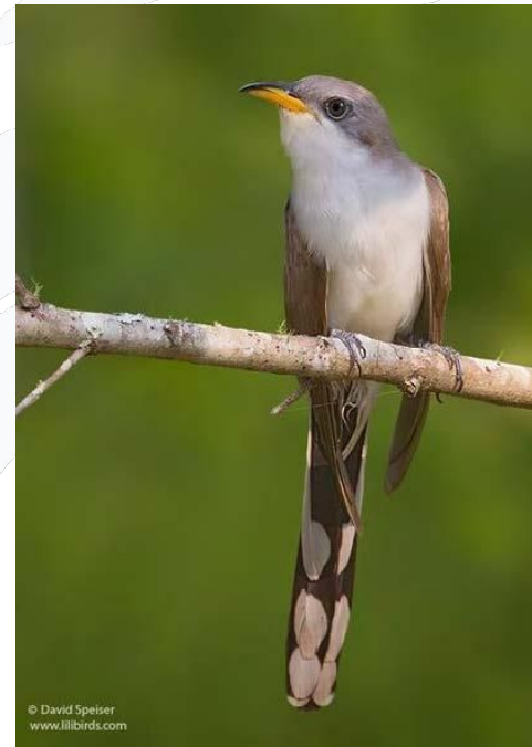
Yellow-billed cuckoo: state-endangered