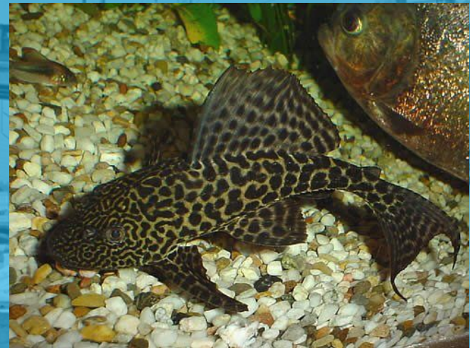
Image: the Amazon sailfin catfish